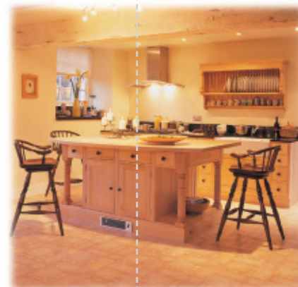
A QUIET-ONE 2000 Series in the cabinet of a kitchen island