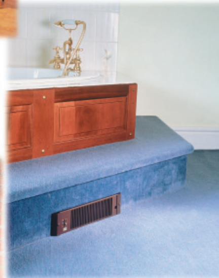
A QUIET-ONE 2000 Series installed in a bathroom