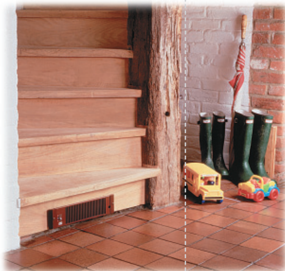
A QUIET-ONE 2000 Series mounted in stairs