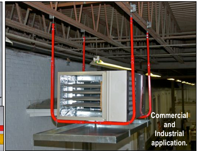
Commercial and Industrial application.

“Steel beams, wood rafters, wood joists, and wood trusses are no match for Quick-Sling Accessories!”