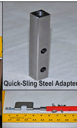
Quick-Sling Steel Adapter