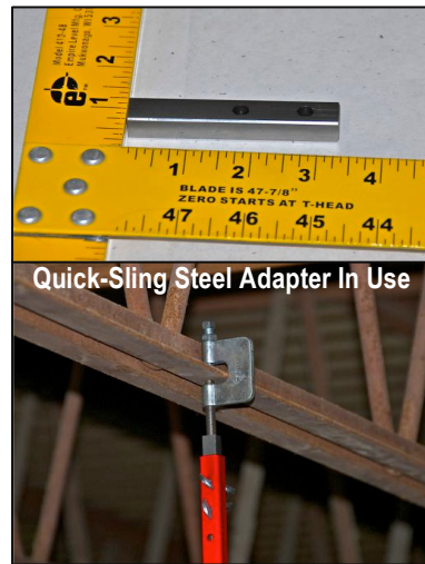
Quick-Sling Steel Adapter In Use